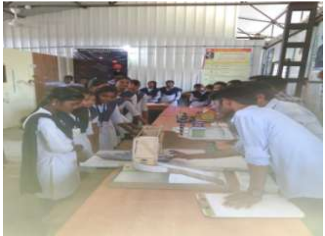
National Science Day celebration