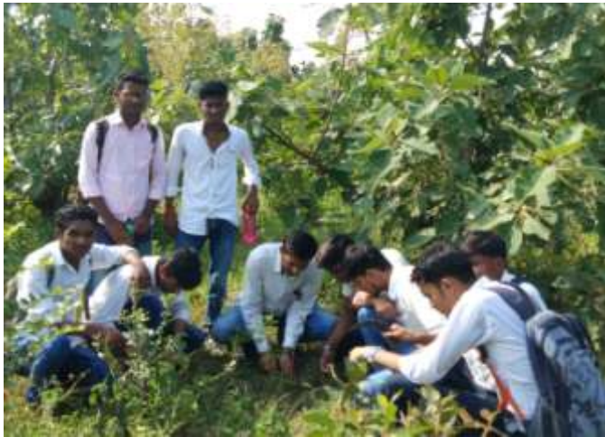
Medicinal plant collection at Melghat Forest