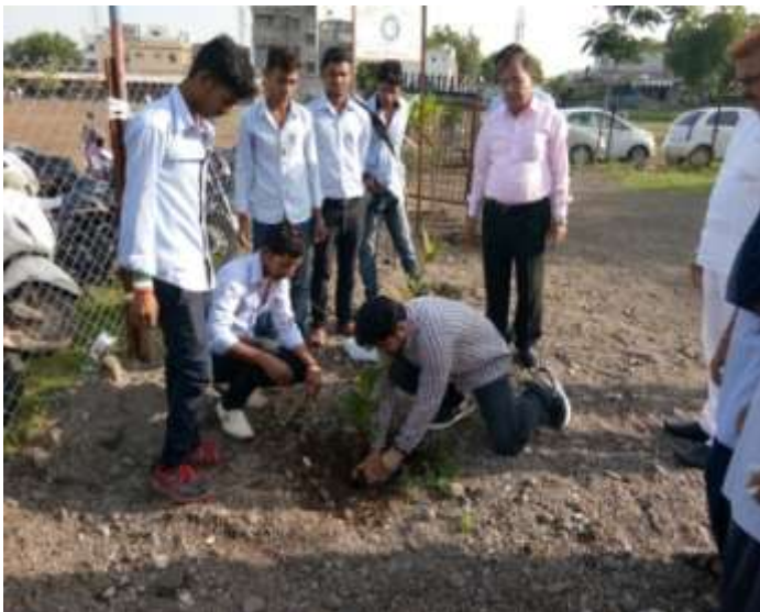
Tree Plantation at college campus