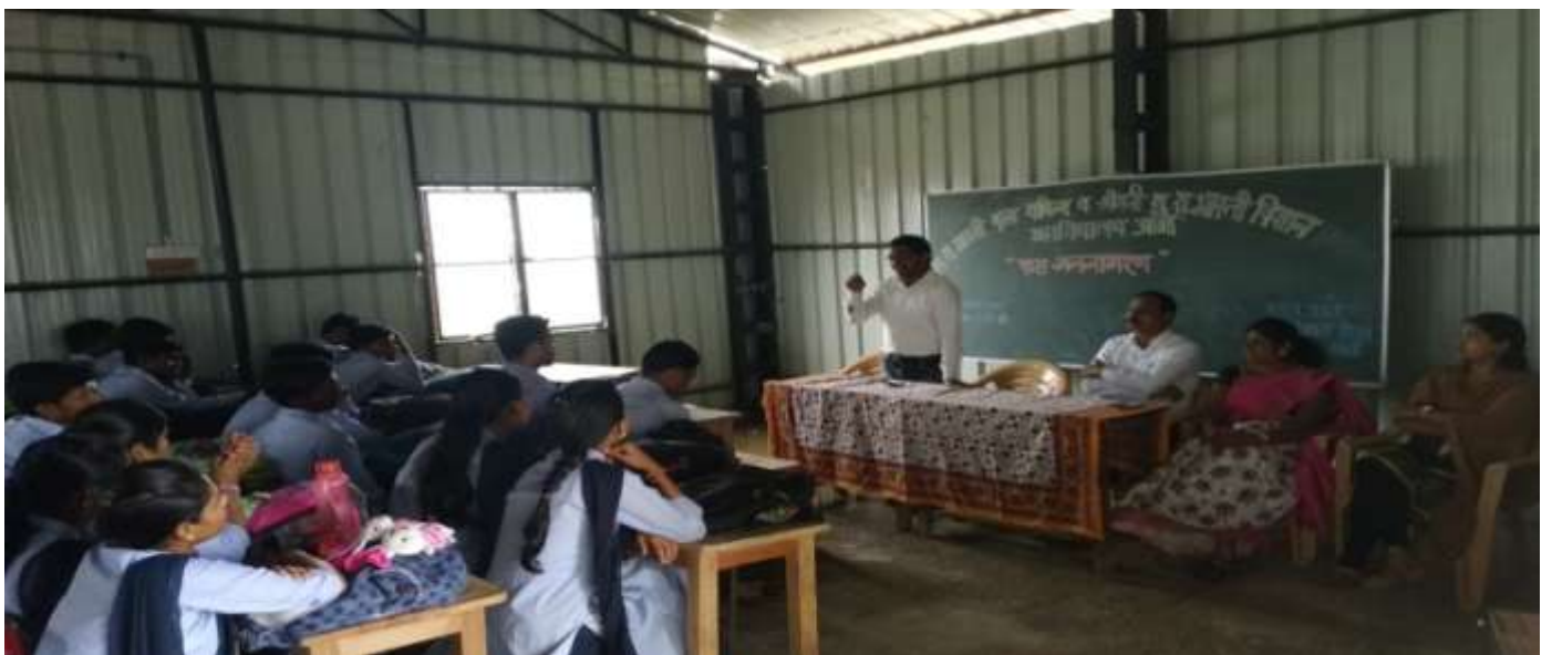
AIDS Awareness workshop